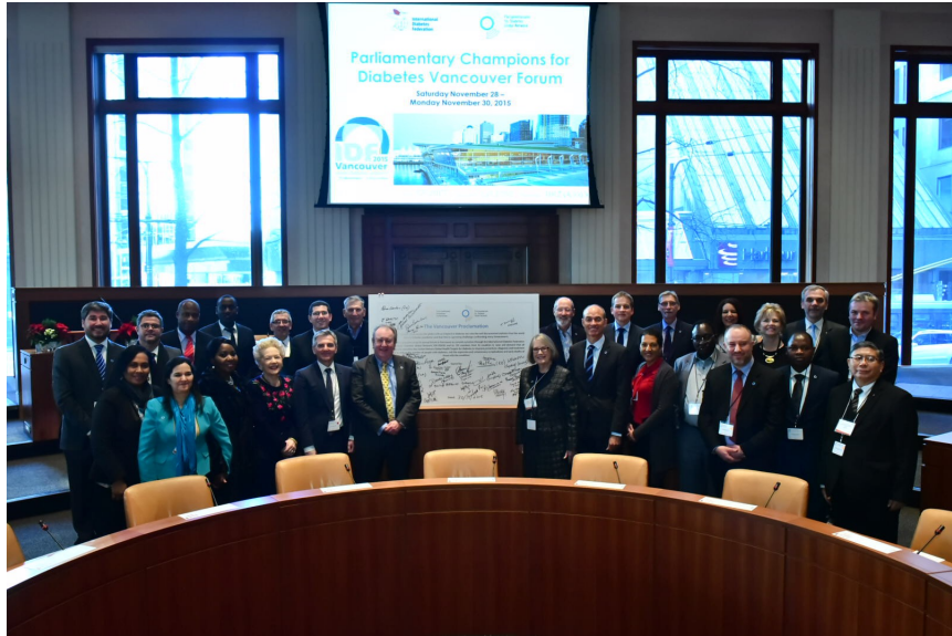
Figure 1 Sir Michael Hirst & PDGN delegates sign the Vancouver Proclamation

IDF PDGN will continue to highlight the need for action by individual members and parliamentary diabetes groups on the Proclamation.